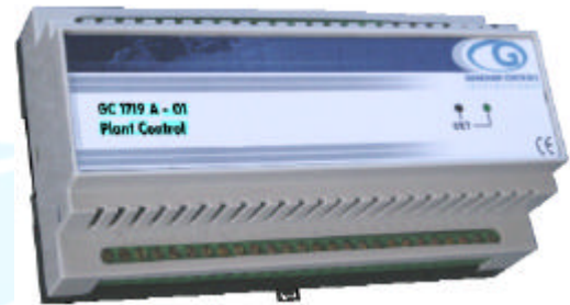
H 86 x L 156 x D 59 mm