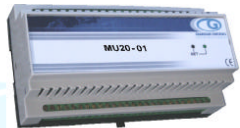
MU-20 Marshalling Unit 86x156x59 mm